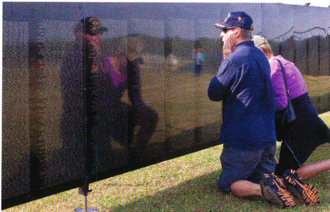
"Oh My God, There's His Name!"