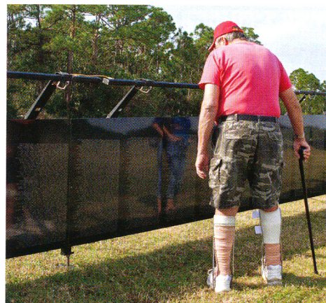
"All Gave Some"