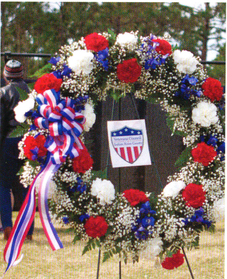
"58,315 Gave All"

A traveling replica of the Vietnam Veterans Memorial arrived in Vero Beach with local motorcycle clubs and law enforcement as its escort, much to the honor of the fallen heroes whose names cover the wall.